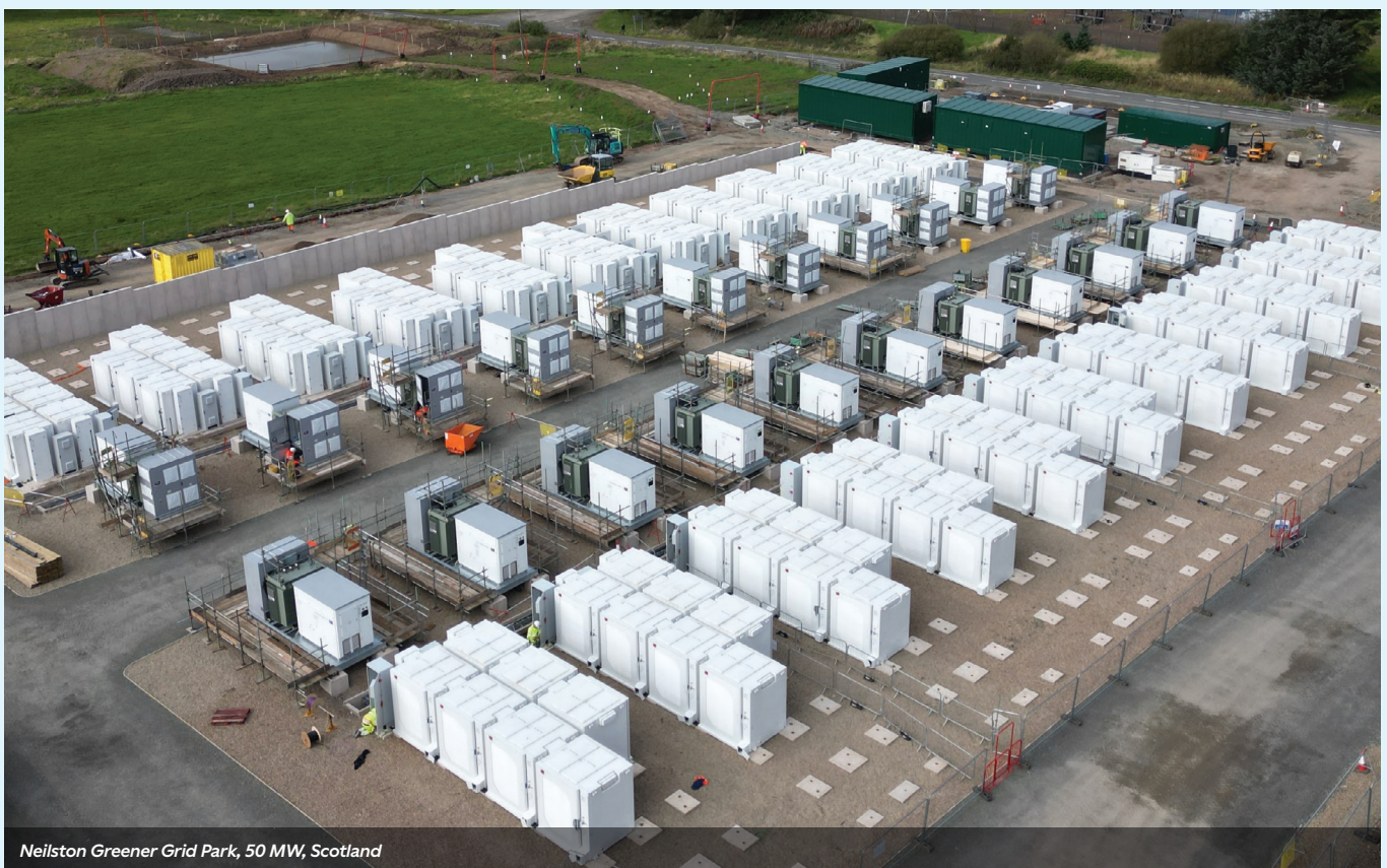
Neilston Greener Grid Park, 50 MW, Scotland

A community benefit fund of £20,000 per year for the life of the project was launched in the first year of construction and is dedicated to supporting community projects to decrease local carbon footprint and advance environmental awareness and education.