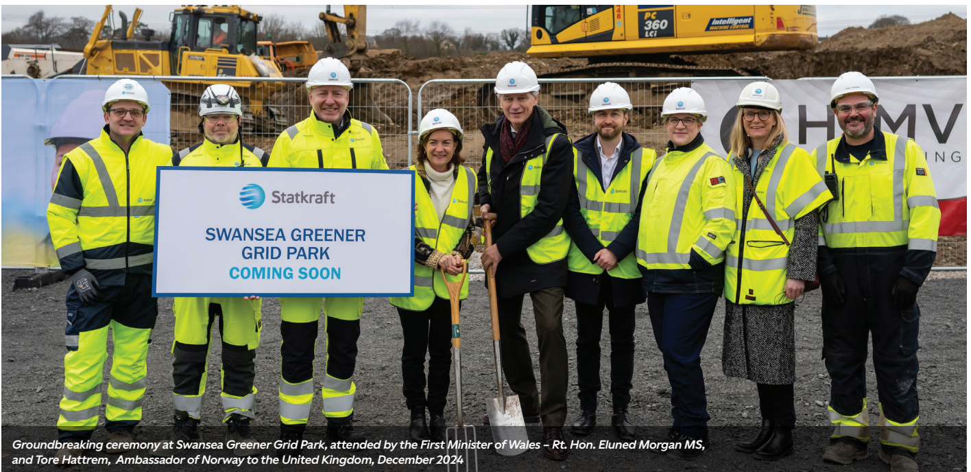
Groundbreaking ceremony at Swansea Greener Grid Park, attended by the First Minister of Wales – Rt. Hon. Eluned Morgan MS, and Tore Hattrem, Ambassador of Norway to the United Kingdom, December 2024

Net Zero is the balance between the amount of greenhouse gas emissions that are produced and the amount that are removed from the atmosphere.